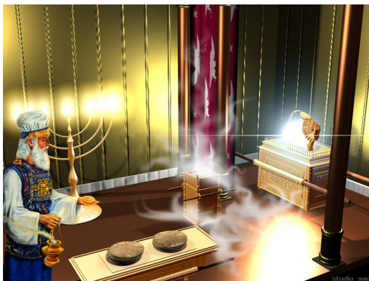
The beautiful garments of the High Priest

Set in the breastplate, one on either side, were two brilliant stones, called the Urim and Thummim. By means of these stones the mind of the Lord could be ascertained by the high priest. When questions were asked, if light encircled the precious stone at the right, the answer was in the affirmative; but if a shadow rested on the stone at the left, the answer was negative.